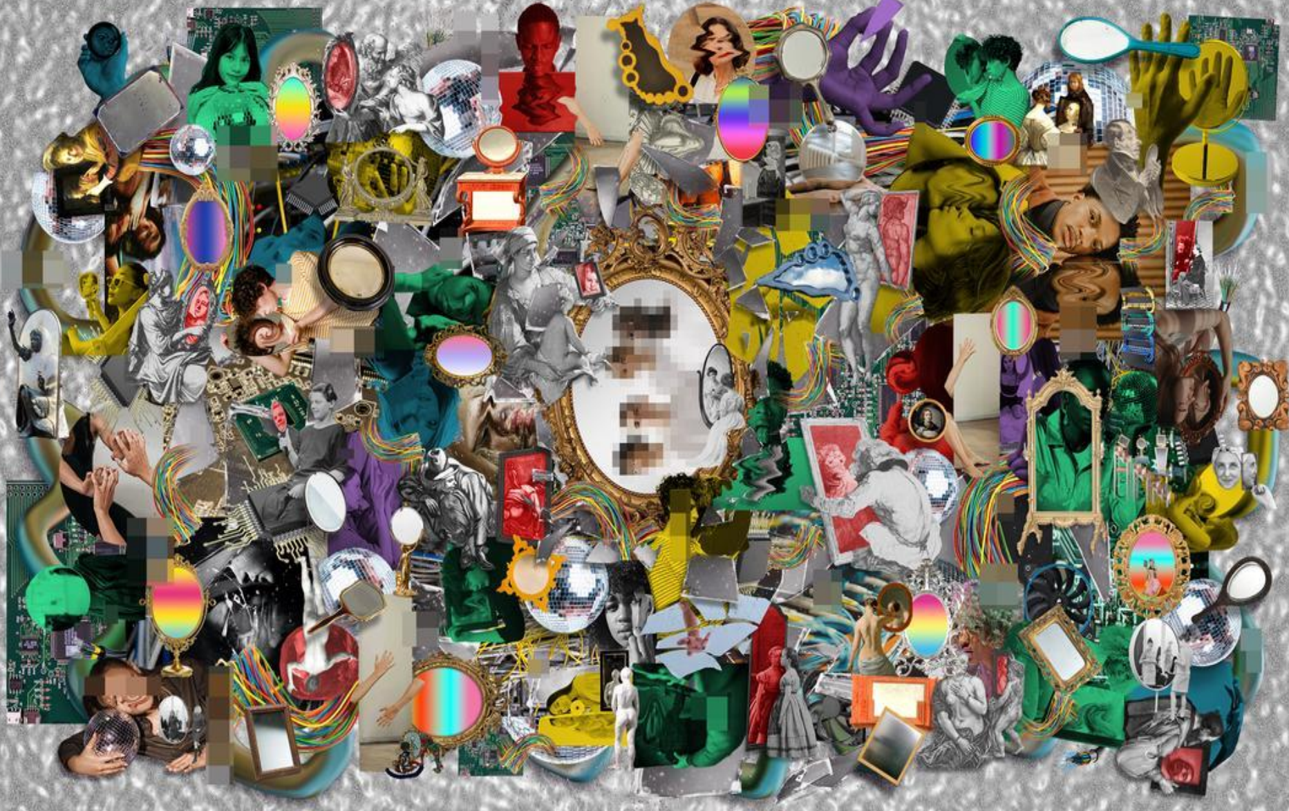
Data is a Mirror of Us