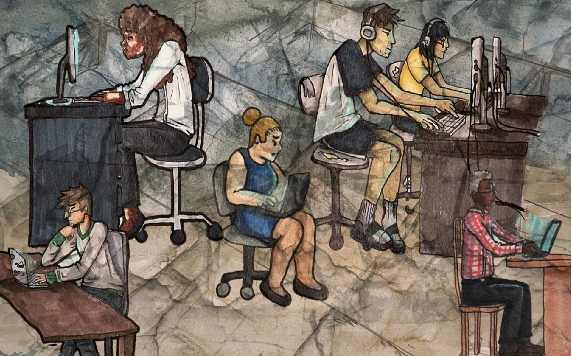
Isolation by Kathryn Conrad & Digit kathrynconrad.com/ / digital-dialogues.co.uk/